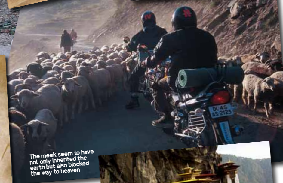
The meek seem to have not only inherited the earth but also blocked the way to heaven